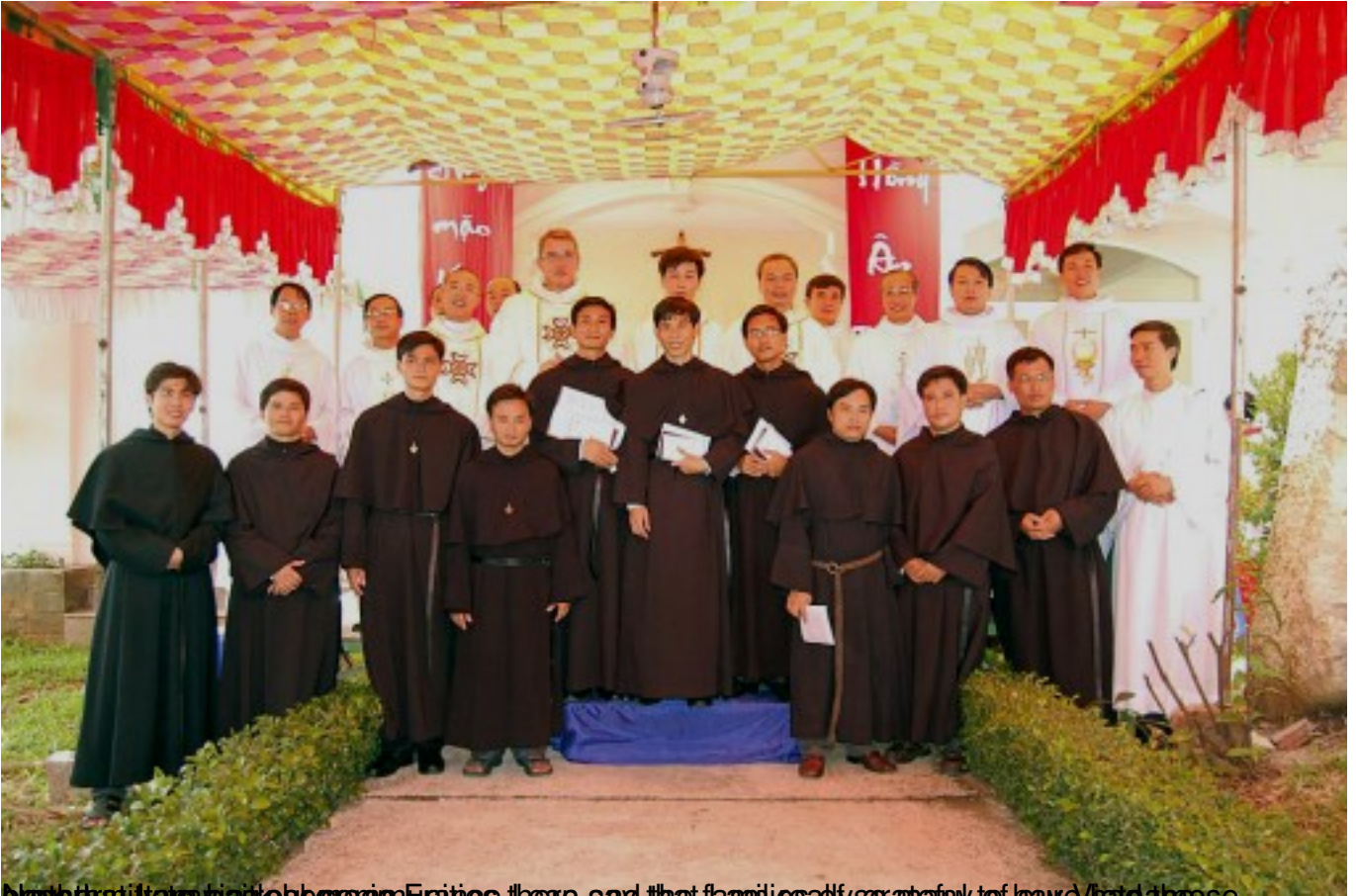
Some of the monks and priests who are saying the families are grateful to have had these