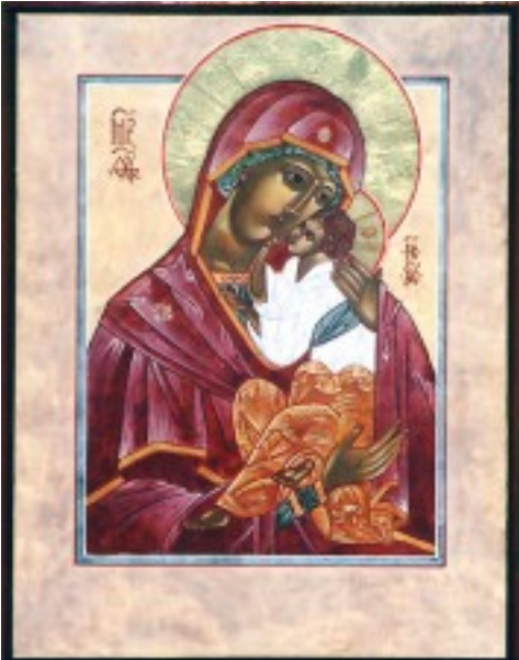
Icon of the Virgin Mary and the Christ Child