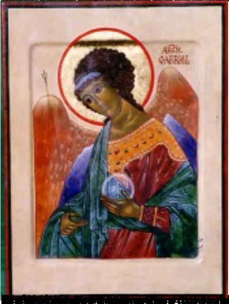
Archangel Gabriel (Archangel Gabriel) the Angel of the Annunciation, the