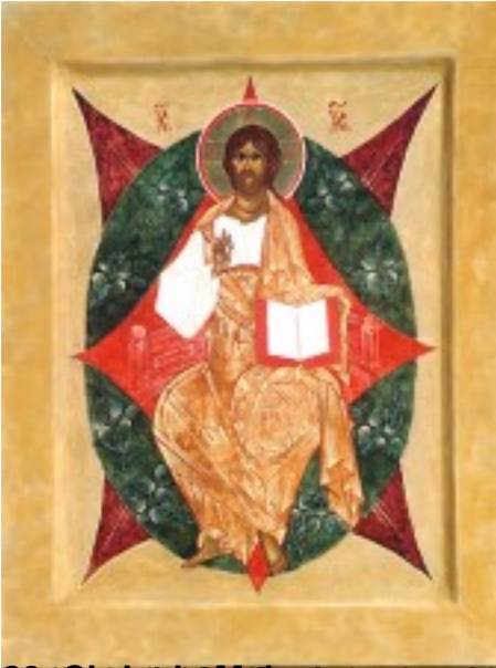
200 Christ Pantocrator (Chalcedon, 5th Century, St. Basil's, Constantinople) - for his right hand he presided