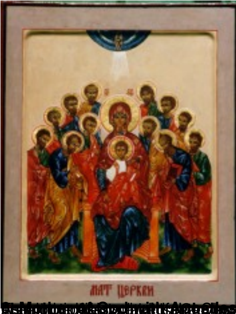
Mother of Sorrows (Our Lady of the Sign) the Virgin Mary, the lover of Christ, of