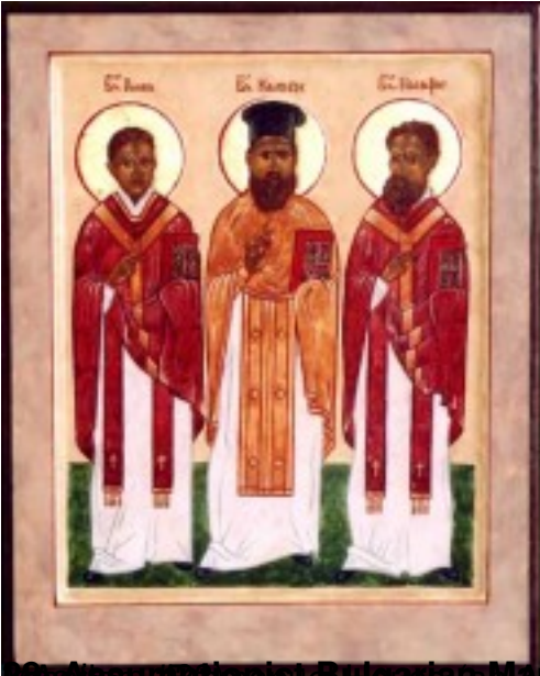
St. Ignace, St. Kamen, and St. Joseph (Community of the Assumption College), Worcester,