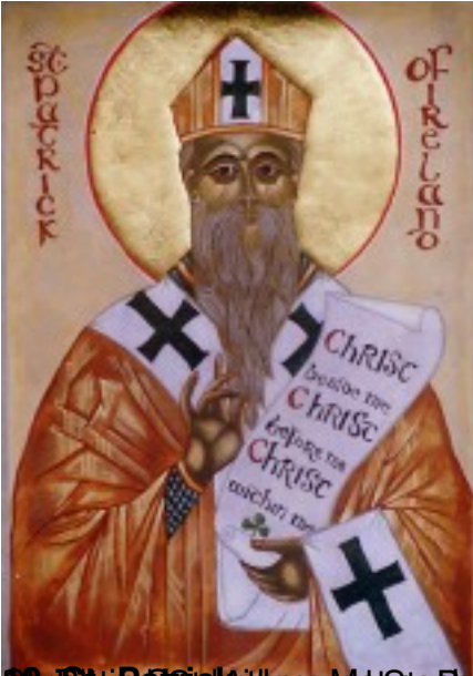
68 St. Patrick, the Apostle of Ireland, Fiddlers Green, MA. One of the patrons of the Assumptionist