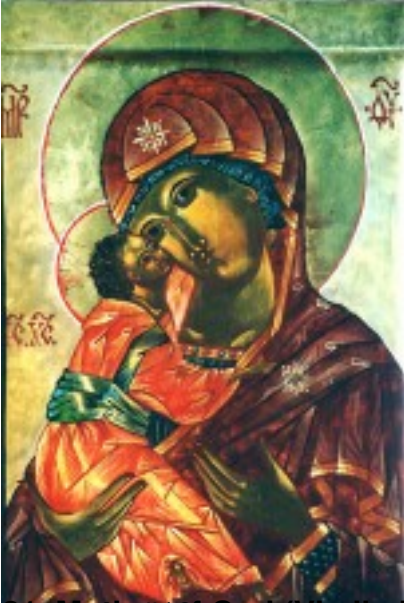
201 Mother of God (Vladimir) - though