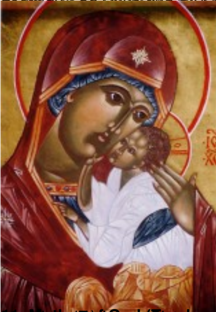
100 St. Andrew's Episcopal Church, Fiske Dale, MA Assumption, Worcester, MA