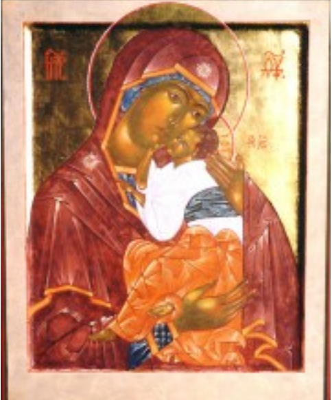
69 Mother of God (Tenderness), Assumptionist Community at Assumption College), Worcester, MA.