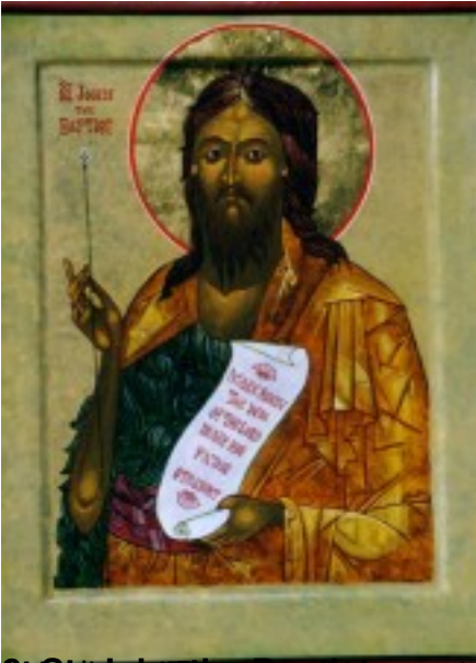
© 2011 Donat Lamothe (an Assumptionist Community at Assumption College), Worcester,