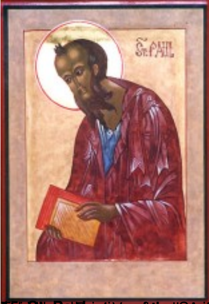
Icon of St. Paul, one of the "Great Apostles of the Church (a pagan world upside down)." He holds