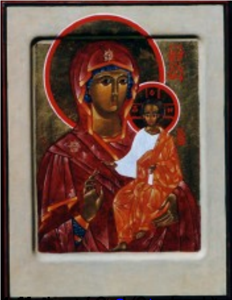
This icon is a reproduction of the original icon of the Virgin Hodegetria, which is a type of icon of the Virgin Mary and the Christ Child. The icon is a reproduction of the original icon of the Virgin Hodegetria, which is a type of icon of the Virgin Mary and the Christ Child. The icon is a reproduction of the original icon of the Virgin Hodegetria, which is a type of icon of the Virgin Mary and the Christ Child.