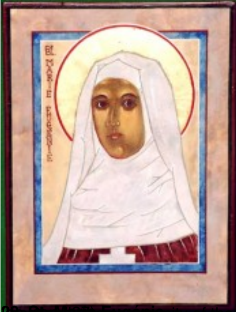
St. Mary the Virgin (Community of the Religious of the Assumption, Lansdale, PA)