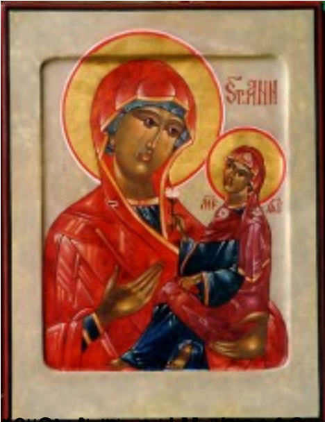
100 St. Andrew's Episcopal Church, Fiske Dale, MA Mary, known as the Theotokos. Mary