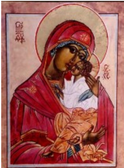
36. Mother of God (Tenderness)