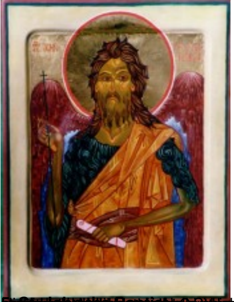
© 2011 Donat Lamothe, A.A. All rights reserved. This icon is a reproduction of the original icon of the Archangel Gabriel, which is a type of icon of the Archangel Gabriel. The icon is a reproduction of the original icon of the Archangel Gabriel, which is a type of icon of the Archangel Gabriel. The icon is a reproduction of the original icon of the Archangel Gabriel, which is a type of icon of the Archangel Gabriel.