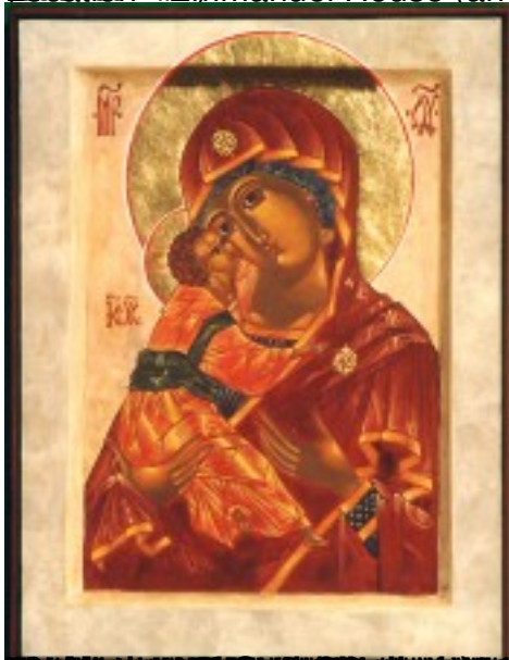
17. The Virgin Mary and the Christ Child (an Assumptionist Community at Assumption College), Worcester,