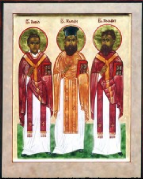
Icon of three saints: St. Basil, St. Kiriakos, and St. Basil