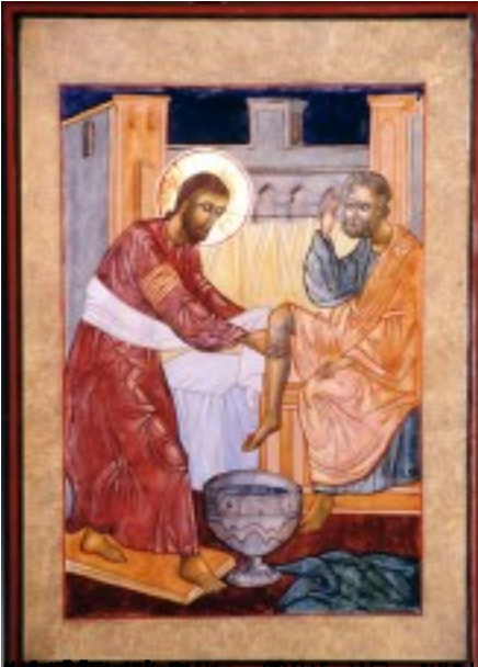
Icon of the Washing of Feet. Jesus is washing the feet of St. Peter (John 13:1-17). When