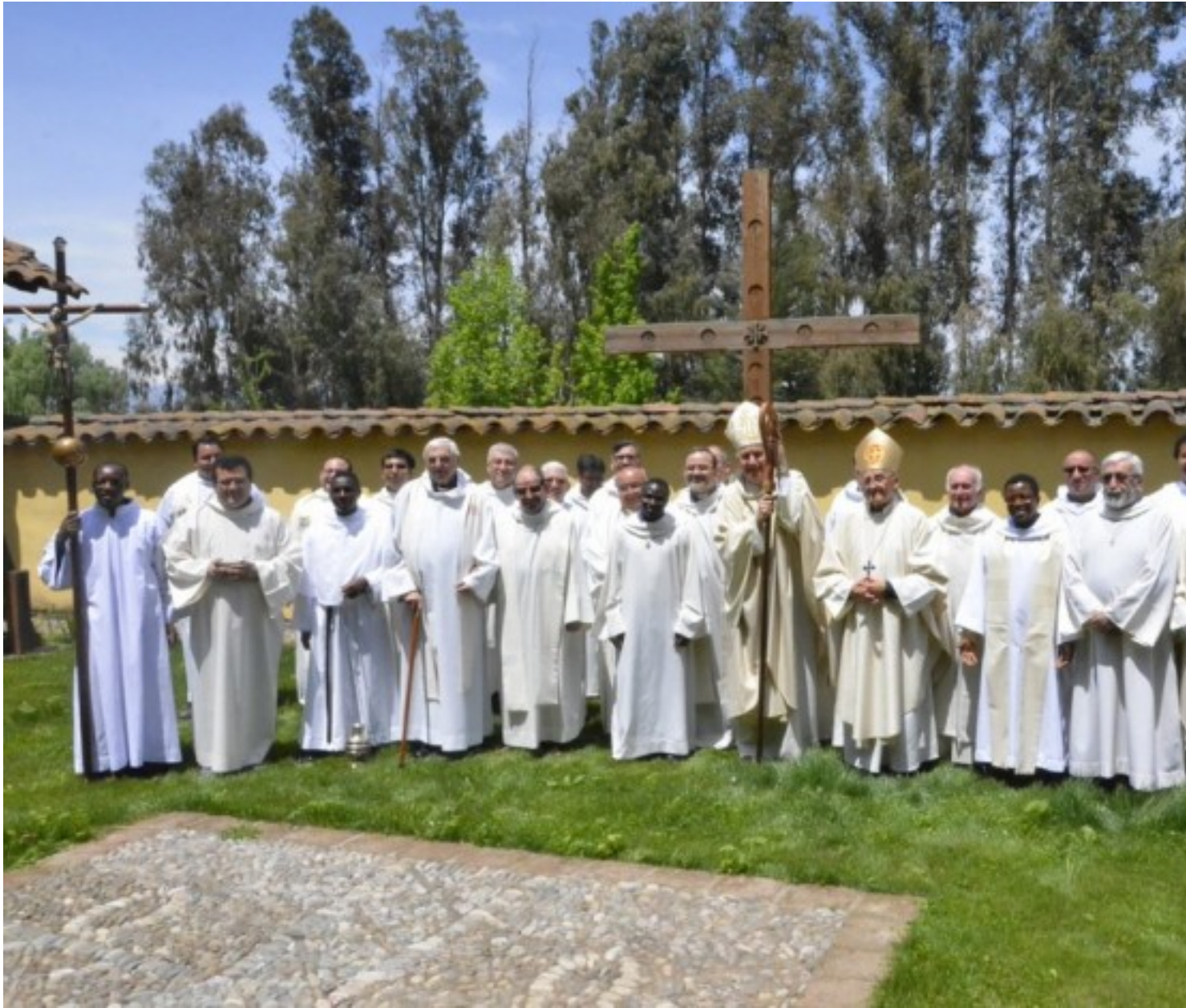
Assumptionists gathered for 125 th anniversary with concelebrating bishops