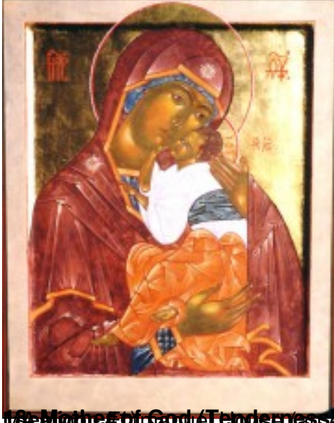
13. Mother of God (Tenderness), Assumptionist Community at Assumption College), Worcester, MA