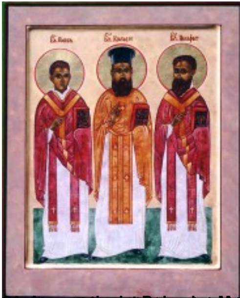
25th Anniversary of the Russian Revolution (St. Basil, St. Gregory, and St. Basil)