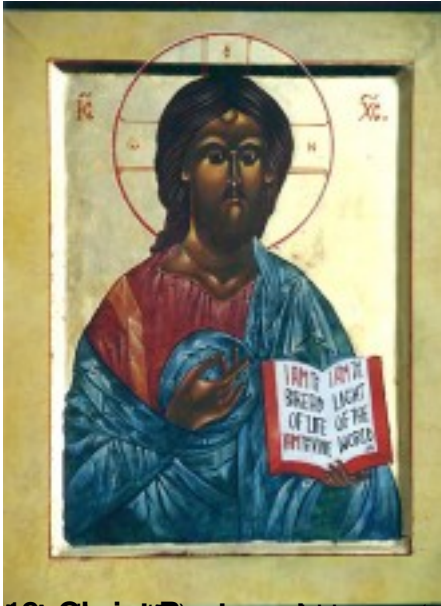
16. Christ Pantocrator (an Assumptionist Community at Assumption College), Worcester, Massachusetts