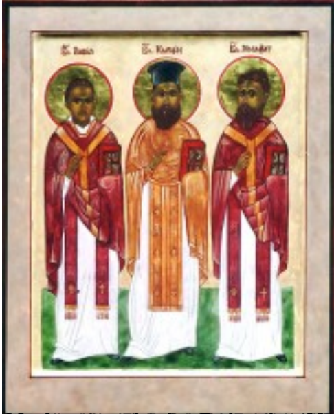
Icon of the Three Holy Fathers (St. Basil, St. Nicholas, St. John) (The Holy Trinity)