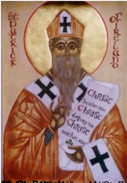
12. St. Patrick, the Patron of the Assumptionist Church, Fiske Hall, MA