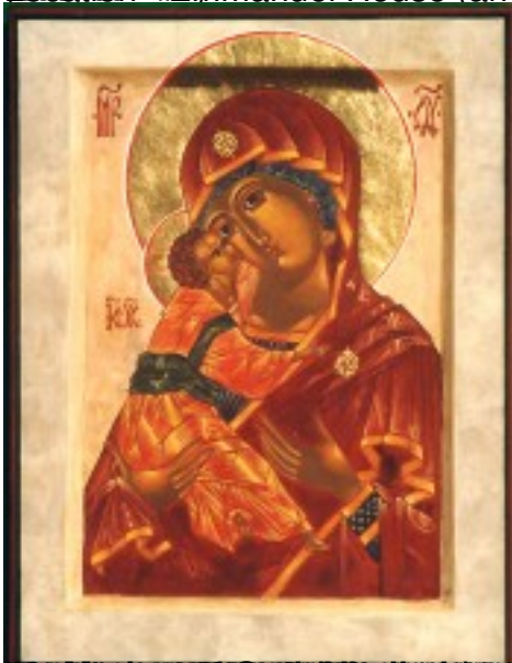
17. The Virgin Mary and the Christ Child (an Assumptionist Community at Assumption College), Worcester, Massachusetts