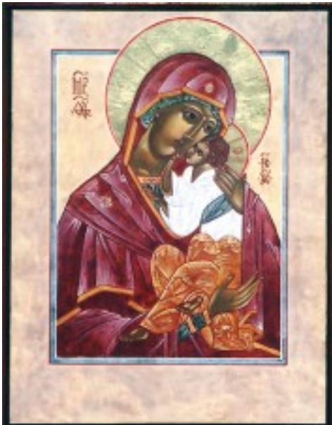
Icon of the Virgin Mary (Theotokos)