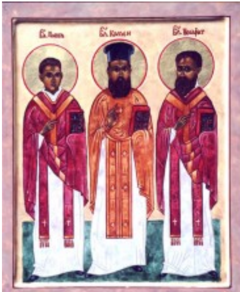
26. Assumptionist Bulgarian Martyrs (Pavel, Kamen, and Josaphat)