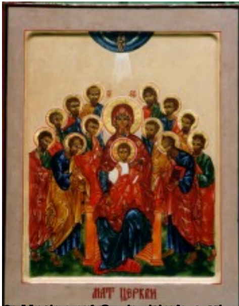
Icon of the Virgin Mary seated with the Christ Child on her lap, surrounded by a large group of saints and angels. The Virgin is wearing a red robe over a blue garment. The Christ Child is wearing a red robe. The group of saints and angels is arranged in a semi-circle around them. The icon is framed by a simple border.