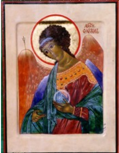
Icon of the Archangel Gabriel holding a globe. He is depicted with a green face and a halo, wearing a blue robe over a red garment. The globe is blue and white. The icon is framed by a simple border.