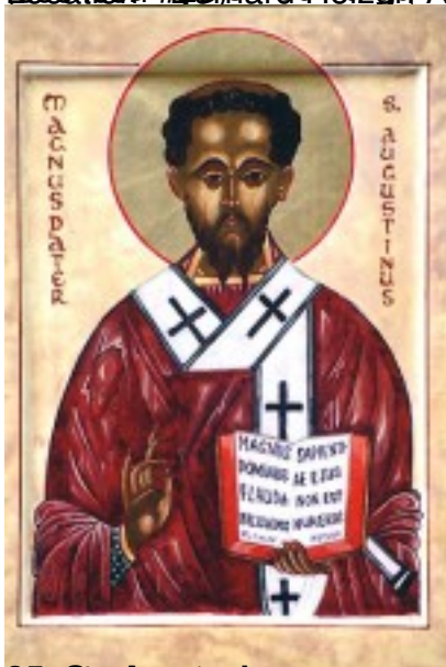
25th Anniversary of the Russian Revolution (St. Augustine)