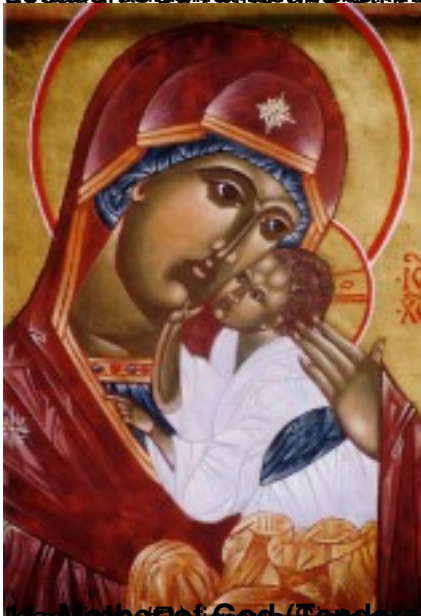
100 St. Andrew's Episcopal Church, Fiske Dale, MA Theotokos (Mother of God) (Tenderness) Assumption, Worcester, MA