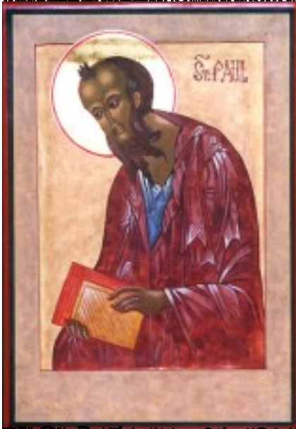
Icon of the Apostle Paul holding a book (example 3 of 17) by Donat Lamothe, A.A.