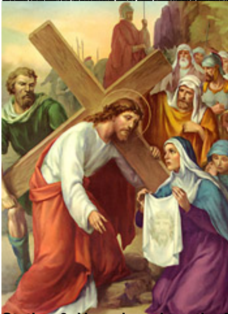
Station 6: Veronica wipes the face of Jesus. (14th century, by Rogier van der Weyden, 1461)