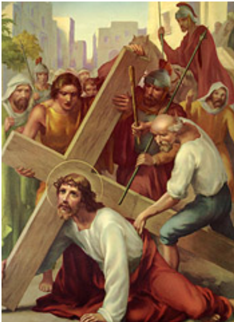
Station 3: Jesus carrying the cross. In the background, a cityscape is visible. The cross is a large wooden structure, and Jesus is walking towards the right.