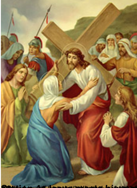
Station 4: Jesus meets his mother. In the background, a cityscape is visible. The cross is a large wooden structure, and Jesus is walking towards the right.