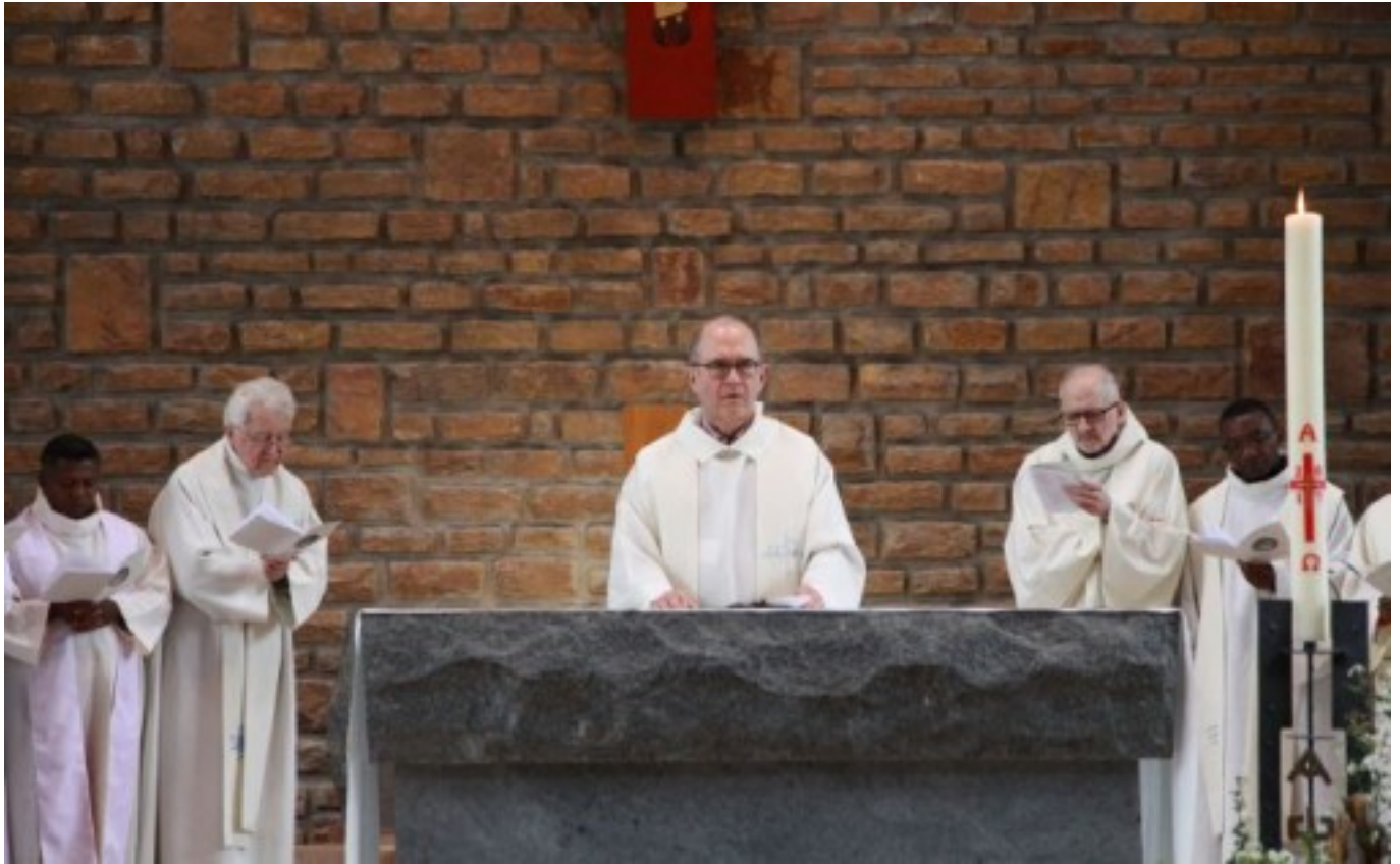
Opening celebration, Valpre, Friday, April 28 with three Superiors General, present and past.