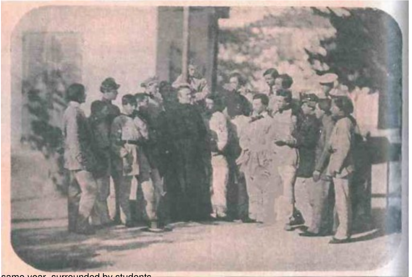
same year, surrounded by students