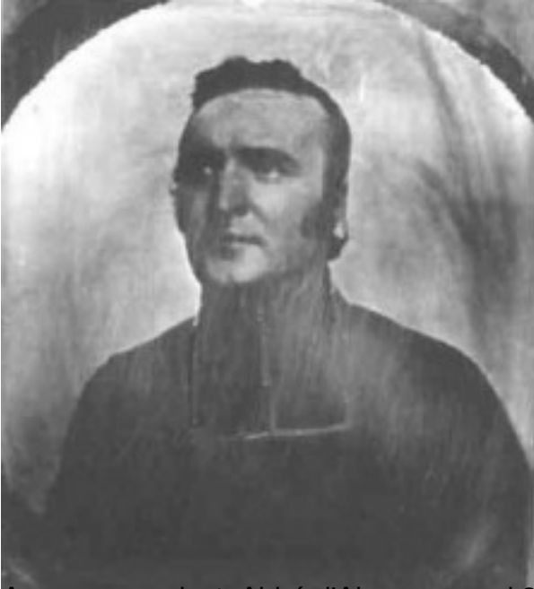
As a young priest, Abbé d'Alzon, around 30 years old.