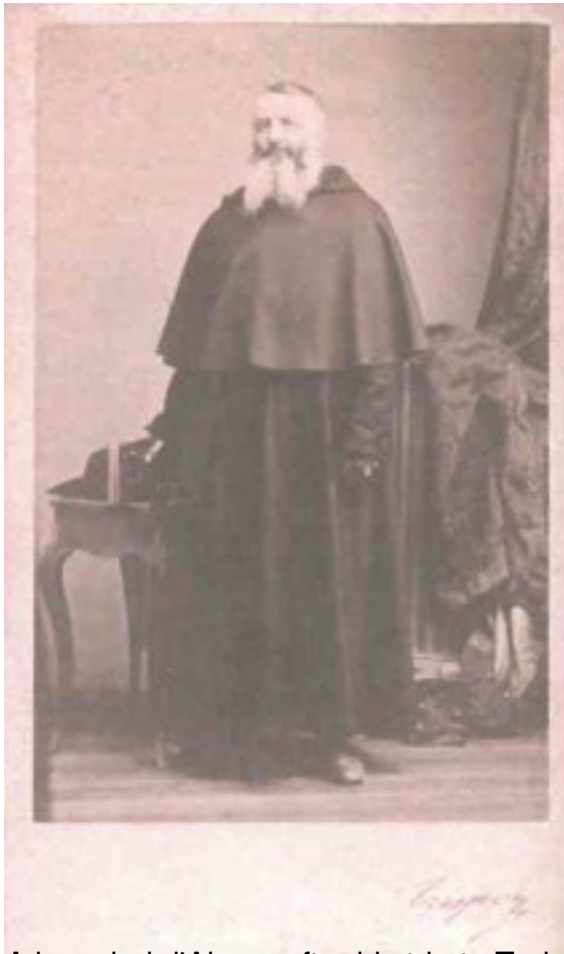
A bearded d'Alzon, after his trip to Turkey in 1863.