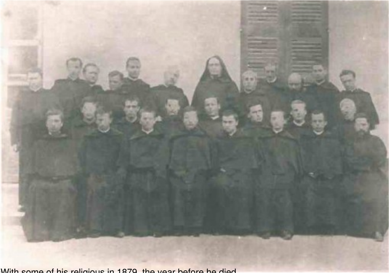
With some of his religious in 1879, the year before he died.