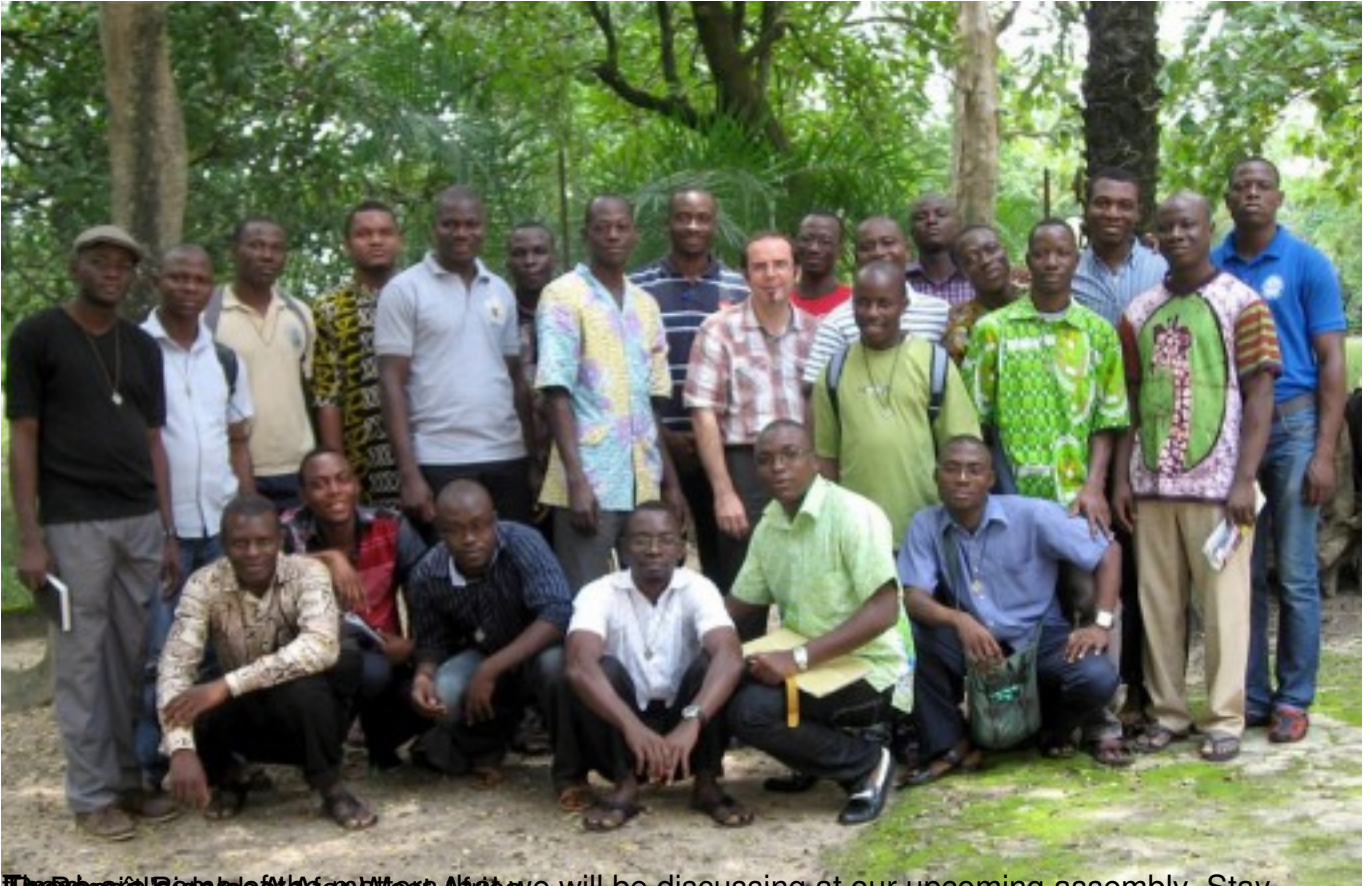
The Seminar on the Role of the Assumptionist in West Africa will be discussing at our upcoming assembly. Stay