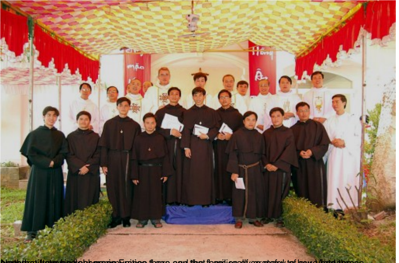
Monks and priests from Eratices there say the families are grateful to have had these