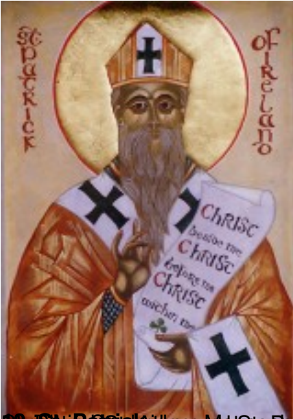
68 St. Patrick, the Apostle of Ireland, Patron of the Assumptionist Community at St. Patrick's Church, Fitchburg, MA