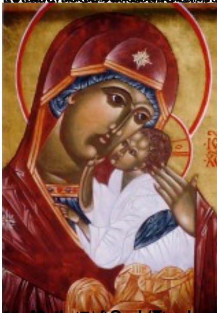
100 St. Andrew's Episcopal Church, Fiske Dale, VA Assumption, Worcester, MA