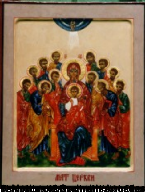
Mother of God with the Holy Spirit and the Holy Trinity (Mother of God is the "Queen of Angels" and the "lover of Christ, of