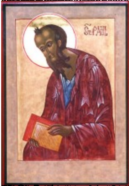
Icon of St. Paul. He is the "Great Apostle to the Gentiles" (a pagan world upside down). He holds