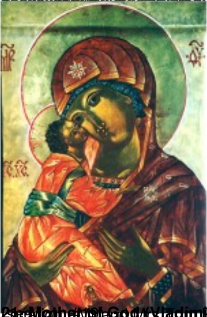
21 Mother of God (Vladimir) by St. Vladimir (10th century)