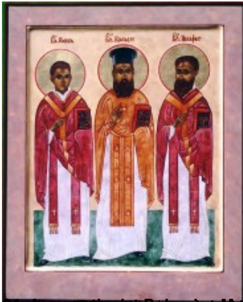
24th Anniversary of the Birth of Our Lady (St. Melchior, St. Caspar, and St. Balthasar)