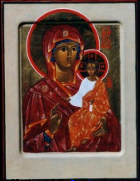
St. John the Evangelist (left) and the Virgin Hodegetria (right) from the "Theotokos of the Sign" (19th century), St. Catherine's Monastery, Sinai, Egypt.