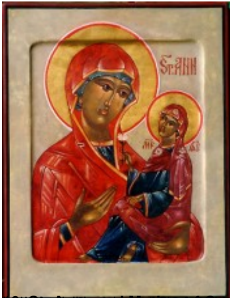
100 St. Andrew's Episcopal Church, Fiske Dale, VA Mary, known as the Theotokos. Mary