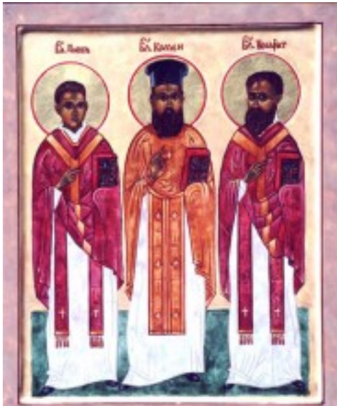
26. An icon of the Bulgarian Martyrs (Pavel, Kamen, and Josaphat)