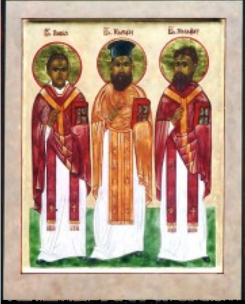
Icon of three saints: St. Basil, St. Kiriakos, and St. Basil