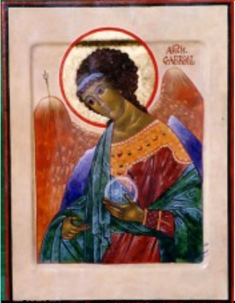
Archangel Gabriel (Archangel Gabriel is the "messenger of God" and the "messenger of the Holy Spirit")