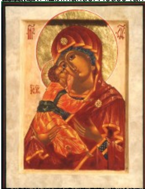
17. The Virgin Mary and the Christ Child (an Assumptionist Community at Assumption College), Worcester,