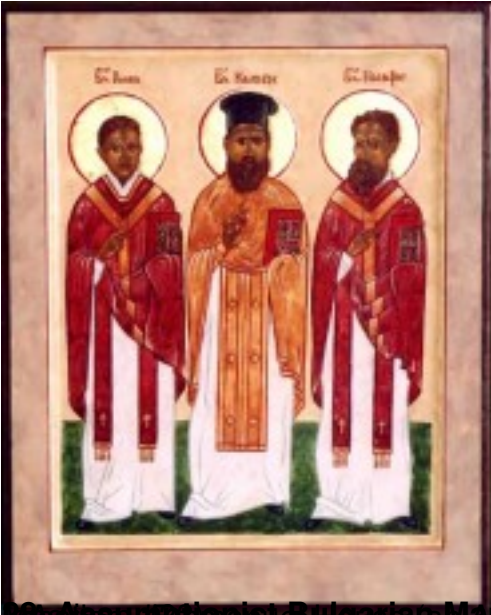
Icon of the three saints Ignace, Kamen, and Joseph (Community of the Assumption College), Worcester,