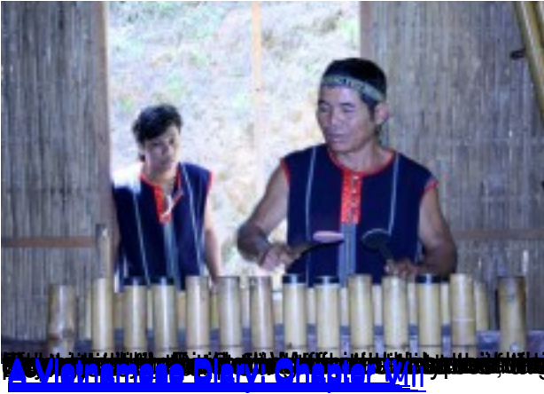
A Vietnamese Clay Chamber