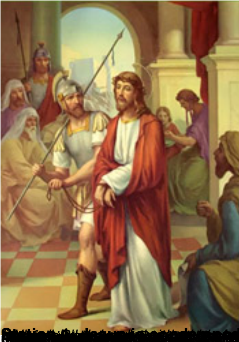
Station 1: Jesus is condemned to death. He is led away to the place of execution, surrounded by a crowd of people, some of whom are kneeling in prayer or distress.