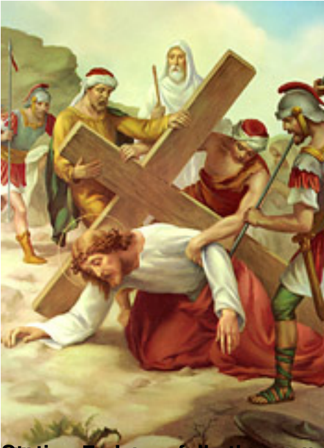
Simon of Cyrene in the time of coronavirus and of