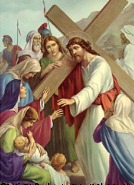
Jesus carrying the cross in the time of coronavirus and of