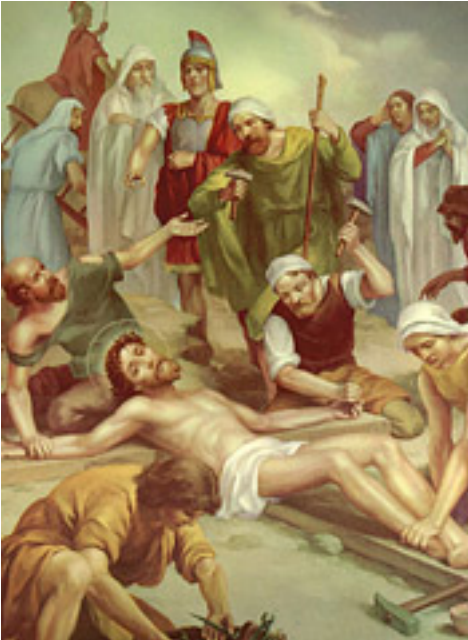
Station 1: Jesus is nailed on the cross. He is surrounded by his disciples and the people who are watching. He is in pain and suffering, and he is dying for the sins of the world.