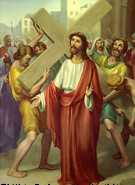
Station 2: Jesus carries his cross. He is assisted by several men, some of whom are carrying the cross's beams. He is surrounded by a crowd of people, some of whom are kneeling in prayer or distress.