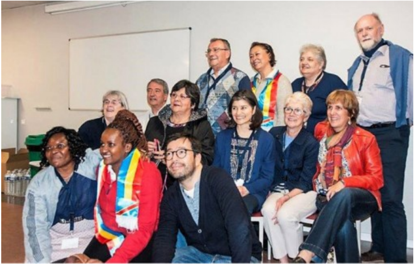
Team of lay people, engaged in the Assumption, invited to the General Chapter